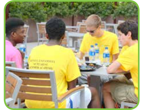
Launched a Planned Giving website- actuarialfoundationplannedgiving.org/