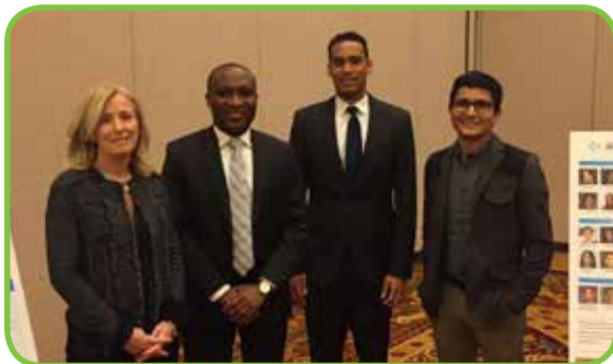
Three scholarship recipients shared their stories at an Ernst & Young sponsored luncheon at the CAS Annual Meeting, raising $4,300 for the Actuarial Diversity Scholarship and the International Association of Black Actuaries Scholarship.