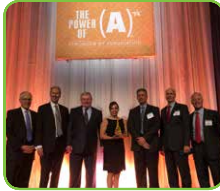
The Actuarial Foundation wins a 2018 Power of A Summit and Gold Award for the Math Motivators tutoring program.