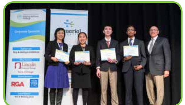
The first participants were awarded $55,000 in scholarships in the inaugural Modeling the Future Challenge.