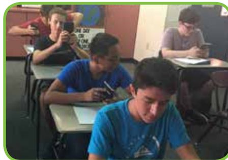
Actuaries throughout the United States raised over $60,000 to rebuild math classrooms in Florida, Houston and Puerto Rico.