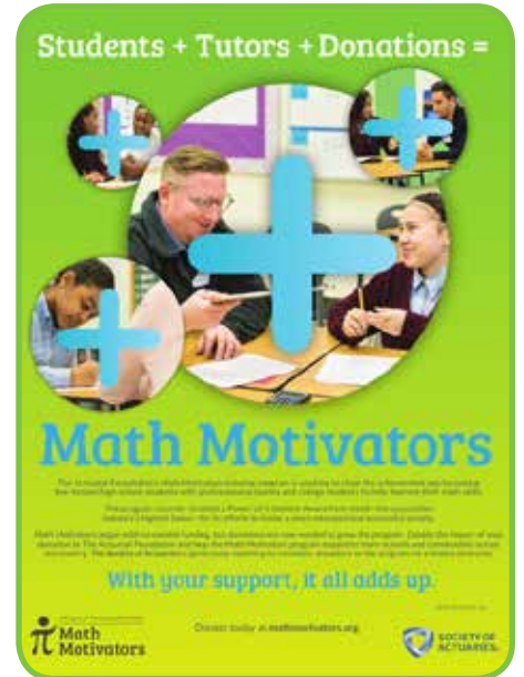
Raised $128,922 in the first year of the Society of Actuaries Math Motivators Matching Gift Campaign.