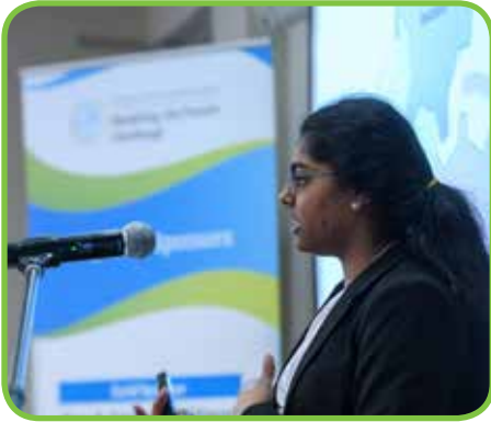
The inaugural Modeling the Future Challenge Symposium was held at the Museum of the City of New York.