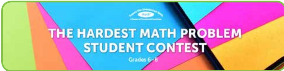
Released several new middle school Math Workshop modules and the Hardest Math Problem student contest as part of the Expect the Unexpected with Math® series.